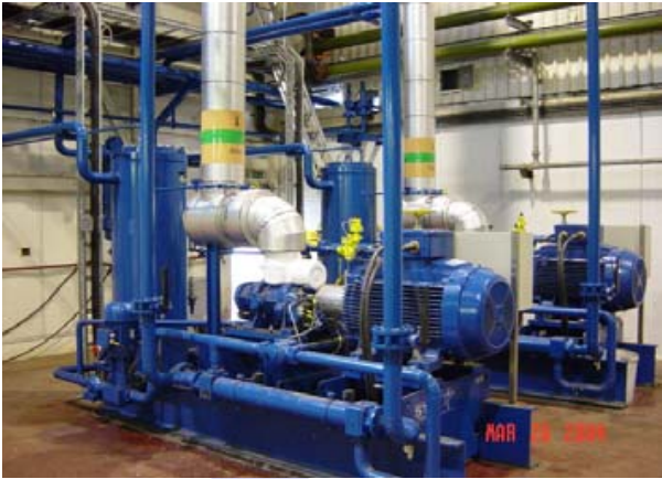
Prosper de Mulder, Vertical Plate Freezers with CO2, Doncaster

carbon dioxide for the cold store would have required operating the high pressure side of the carbon dioxide system at lower conditions than was acceptable for optimised operation of the low temperature freezing plant and the client's preferred supplier of scraped surface heat exchanger could not supply a unit suitable for operation at the pressures that would be seen with carbon dioxide.