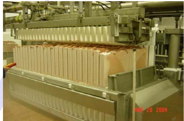
Frozen meat ready to be removed from the freezer

Prosper de Mulder has completed the installation of an environmentally friendly and highly efficient plate freezer system. The freezers are unusual as they use carbon dioxide as the refrigerant, replacing old plant which used R-22. In this application CO 2 is an ideal choice because it has no ozone depleting potential and will not be subject to impending “F-gas” regulations. It is also fundamentally non-toxic and therefore is suitable for a system where the freezers are in a labour-intensive production area. Using ammonia in plate freezers is also a risk to site personnel, which is eliminated by the selection of CO 2 . However, the greatest advantage in the use of carbon dioxide is that it enables the plant to run at lower temperatures and lower power consumption than could be achieved with R22 or ammonia. This improvement in performance results partly from greatly improved heat transfer within the plates of the freezer and partly from the reduced pressure drop in the flexible hoses and suction line from the freezer. This means that freeze times have been significantly reduced – a core temperature of -18°C is reached in the 75mm blocks of meat in 60 minutes, compared to the time of over 2 hours which would be required in the R-22 or ammonia plants.