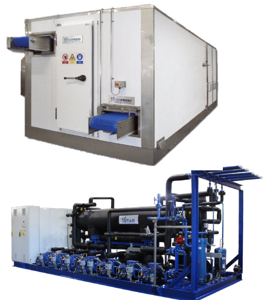
Transcritical CO 2 Package with Low Pressure Receiver and Remote Gas Cooler, for Spiral Freezer Application

The 29,000 European installations mentioned earlier all relate to transcritical CO 2 systems, that is to say, systems that operate both above and below the critical point of the refrigerant circulating inside of them. These systems are typically a single refrigeration package with one or more temperature levels that remove heat from the space being cooled and reject it directly to the ambient air outside. By rejecting heat to the external ambient, the critical point of CO 2 (31°C) can be exceeded on warmer days and at such times, transcritical systems are designed to generate liquid from a supercritical fluid; a process that takes more energy than standard subcritical operation. In the mild UK climate however, the mean annual temperature is <10°C and systems operate in their most efficient mode (subcritically) for the vast majority of the year. The image below shows an example of a transcritical CO 2 compressor package installed for a spiral freezing application near Glasgow.