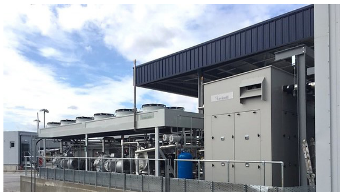
A Housed, Subcritical CO2 Package Operating Alongside a Low-Charge Ammonia Chiller

This is just one of many subcritical CO2 system architectures available and the optimal solution will depend on the specific application in question. Other configurations include pumped, direct expansion and volatile secondary systems.