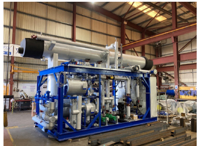
Figure 2. Packaged Industrial Heat Pump In Manufacture

The majority of energy used during cooling processes is discarded to the environment through condensers or cooling towers. By capturing and boosting this waste heat, industrial refrigeration systems can play a positive role in decarbonising our future heating demands and avoid the need to burn gas. Implementation of heat recovery and heat pump systems similar to that in Figure 2 will enable waste energy to be captured and used for hot water heating and other heating processes. Applications generating water at +90°C are in operation today and development of higher temperature systems is ongoing. For sectors where there are large heating and cooling demands such as food production, energy recovered from refrigeration plants and boosted by electrically driven heat pumps can be used to heat water for CIP and other process requirements. For businesses with a large cooling demand but a small heating demand (e.g. temperature controlled warehouses, data centres) waste energy could be recycled into district heating networks for use by others and by doing so, reduce emissions elsewhere.